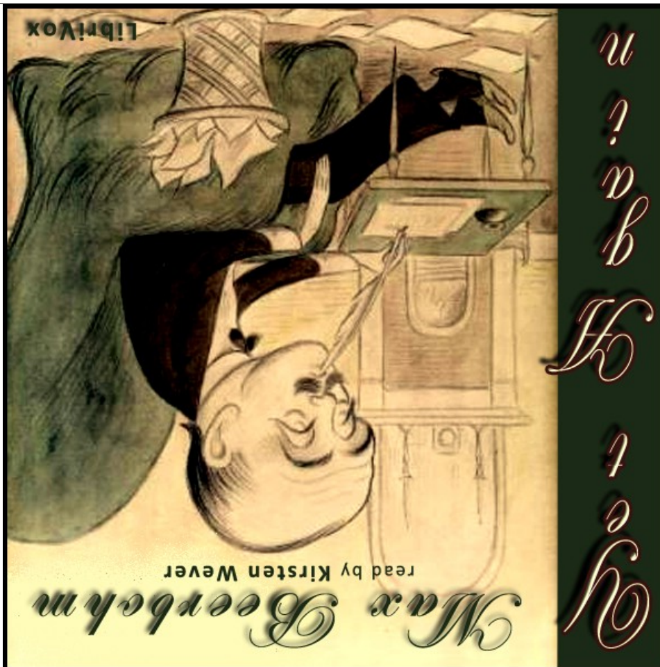
Cover Illustration: by Max Beerbohm, a self-portrait Cover design for Librivox by Michele Fry

Easy Folding Instructions for this Origami CD case, including step by step photos, can be found here . Can also access from the LV Wiki page, CD Covers.